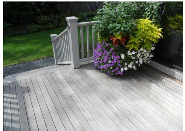
4" WIDE DECK BOARDS